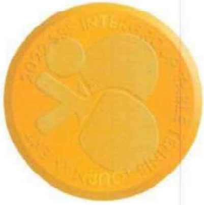
TABLE TENNIS - Medal