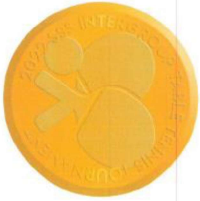
TABLE TENNIS - Medal